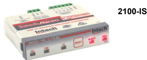
USB converter isolating Alarm for communication failure.