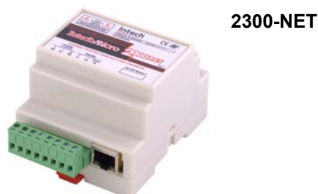
Ethernet TCP/IP to RS485 converter isolating

Note: The 2300-NET is used with the 2300 Series I/O Remote Stations when connecting via Ethernet TCP/IP. For the 2400/2100 Series I/O Remote Stations and Shimaden Controllers via Ethernet TCP/IP use the 2100-NET.