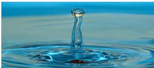
Pure Water Contains Few Ions & Strictly No Irons