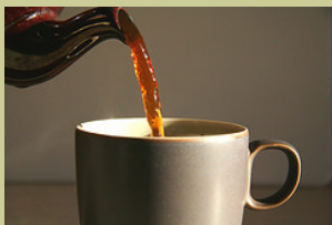
Take a break: Contact Intech Instruments.

For almost 25 years Intech Instruments have been operating throughout New Zealand, servicing a variety of industries. Our product range is made up of both our own high quality manufactured products plus a range of first class imported items.