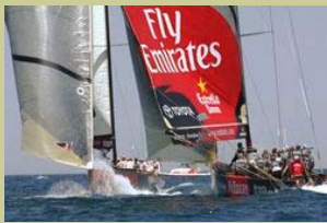
Team New Zealand use Intech hardware & software

E-mail: sales@intech.co.nz www.intech.co.nz