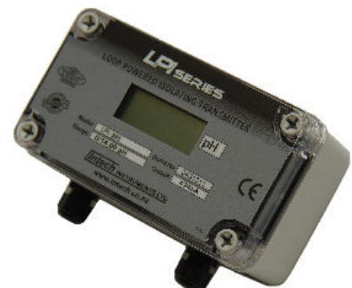
Intech LPI-pH Transmitter

Conductivity is the reciprocal (inverse) of electrical resistivity and has the SI units of siemens per metre (Sm -1 ). Measuring conductivity can provide a guide to the contamination of water. The higher the purity of water, the lower its conductivity