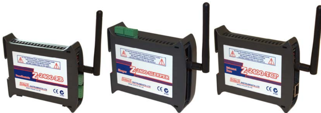
Z-2400-RB Base/Remote module - RS485/RS422 input