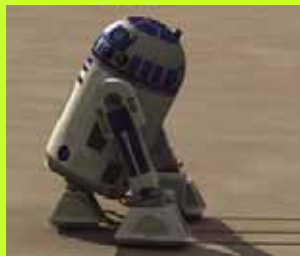
R2D2: Almost Intech Quality

Nivelco manufacture some well priced level switches for a variety of applications. Probably the most popular is the NIVOMAG MKA-210 units (left) used extensively in the Bitumen and Petroleum Industries. These switches provide great reliability and easy operation. NIVOMAG MKA's are Lloyd (GL) certified units