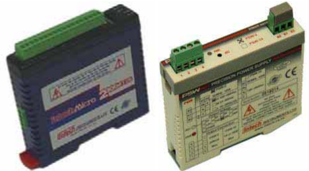
What Pair: New 2300 series & PSW Power Supply