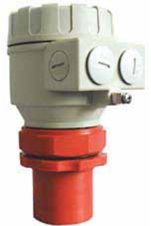
[Right: Nivelco Ultrasonic]