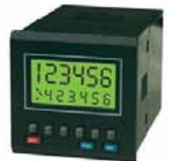
7922/7932 Counter / Timer

A favourite with switchboard applications, user friendly, reliable and above all economic, Trumeter units are very highly regarded.