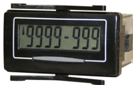
7511/HV Self Powered Counter

Intech hold stocks of counting, timing and hour meter units by Trumeter