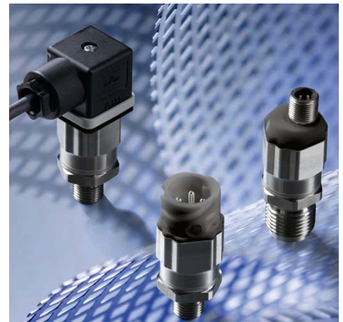
New: JUMO DELOS SI (left) and MIDAS S05 (right)