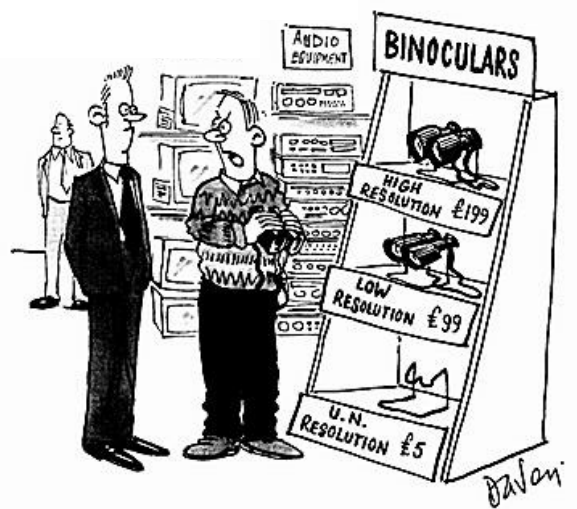
"Everything looks fuzzy through these"

Resolution does not apply to analogue devices as they provide continuous signals (not broken into discreet 'steps').