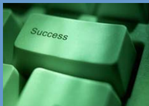
The Intech Affect