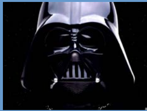
Vader: Impressed by Intech

Intech Instruments Ltd PO Box 8460 Havelock North 4157 Phone: +64 (6) 875 1919 Fax: +64 (6) 875 1920 E-mail: sales@intech.co.nz www.intech.co.nz