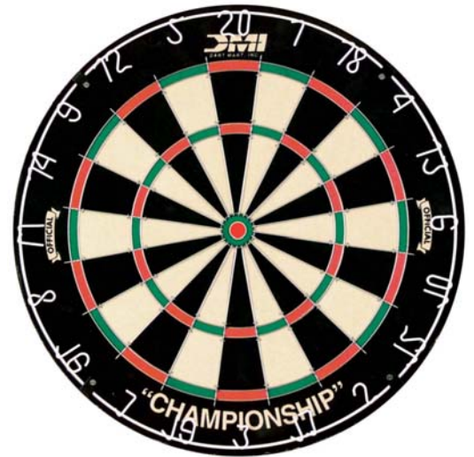
Dart Board: Missed by many a reveller

You miss the board entirely. You may have drunk too much or are purposely aiming at someone?