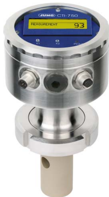
Good Gear: JUMO CTI