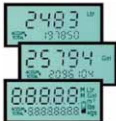
BT Series Battery Totaliser Display Screens: